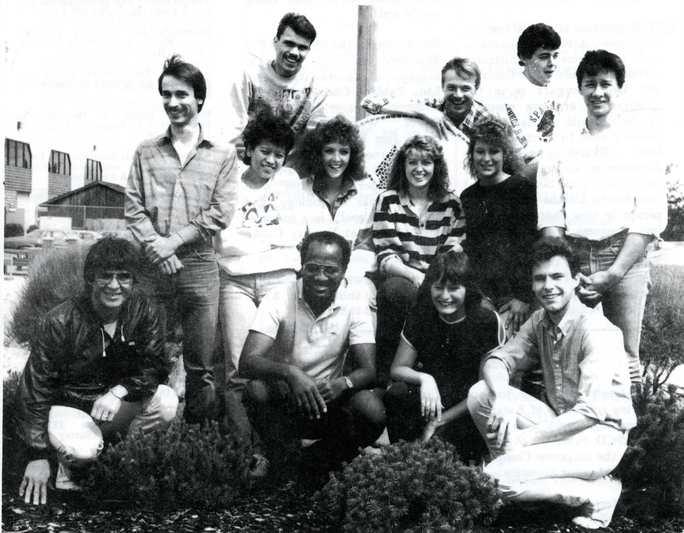
Business Management Graduating Class—1987